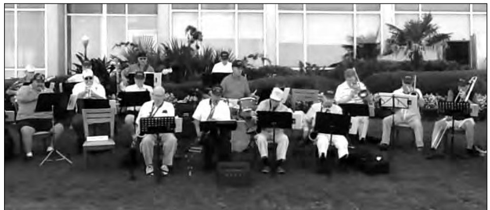
At MASA, Touch of Class plays on the lawn of the hotel facing the boardwalk and the beach.

I am proud to be part of a great bunch of guys who help and encourage each other and have fun doing it. Without being asked, they assist physically to set up, tear down and move equipment. Everyone earned, and gets, big thanks from me for pitching in.