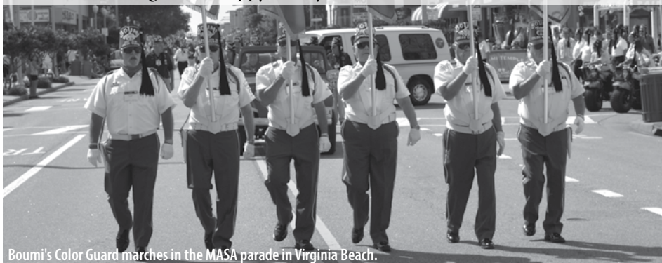
Boumi's Color Guard marches in the MASA parade in Virginia Beach.

May God bless America and may God bless you and yours in this upcoming holiday season. Happy Thanksgiving, Merry Christmas, and Happy, Healthy 2014!