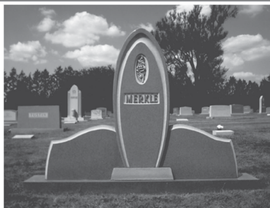
Family Owned Since 1933